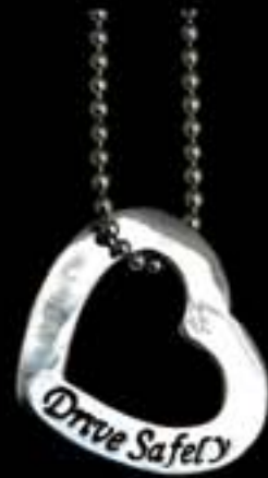
330M Rearview Mirror Heart Ornament Ornamento del corazón del espejo de Rearview A token reminder to always travel safely. Open heart is inscribed with 'I Love You' and 'Drive Safely' on a bead ball chain to fit over your rearview mirror.