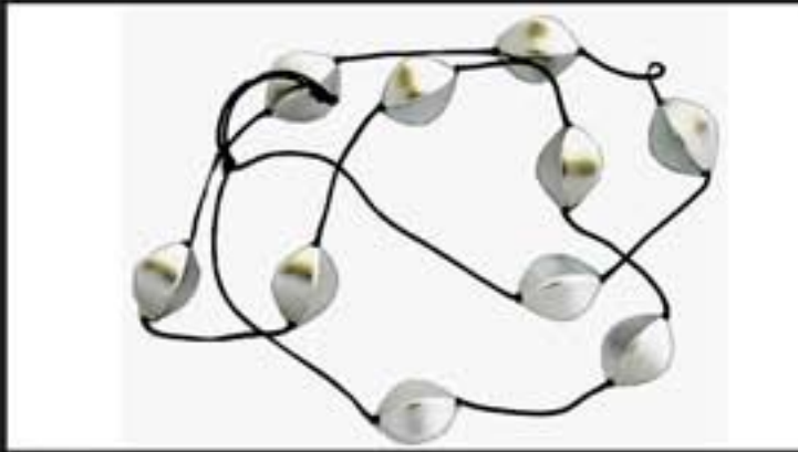
240N Silver Tokens Necklace Collar de plata de los símbolos All the rage! This long and sleek necklace holds ten silver tokens on black knotted cord.