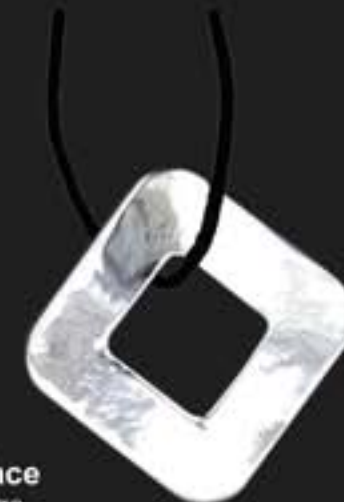
161N Plaza Necklace Collar de la plaza Simple and Stylish! Black silk cord and closed with a lobster claw clasp. 16 - 18" adjustable