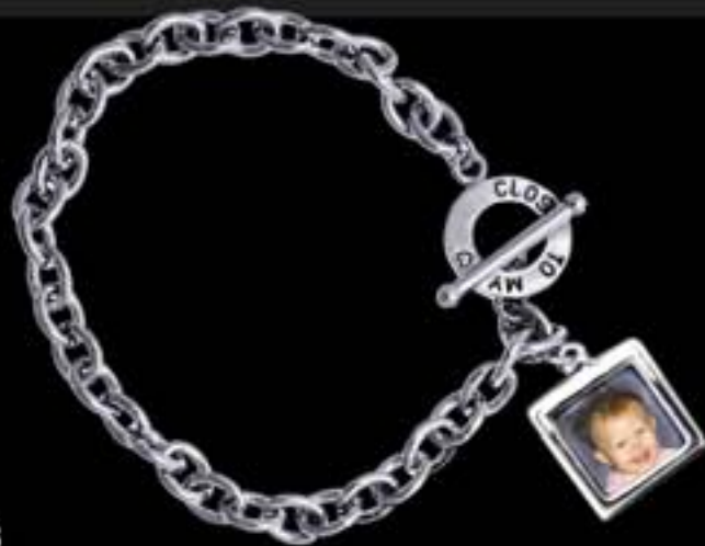
159B Close to My Heart Photo Bracelet Cerca de mi pulsera de la foto del corazón Enjoy showing off your special someone with this photo charm bracelet. Toggle reads "Close to My Heart". 7.5" L