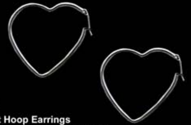
211E Heart Hoop Earrings Aros y pendientes de los corazones Classic hoop earrings with a sweet and symbolic shape! 1.5"D with leverback posts. Hypo-allergenic