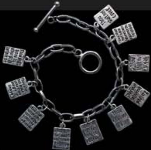
300B Ten Commandments Bracelet Pulsera de diez mandamientos A constant reminder to live by. 7.5" with toggle clasp.