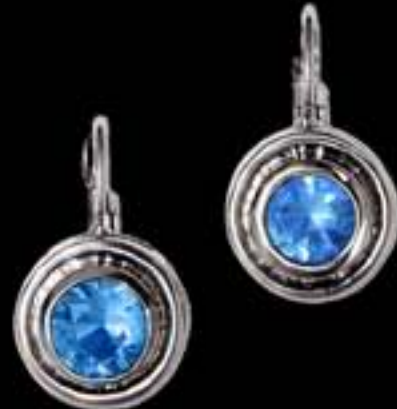
133E Blue Lagoon Earrings Pendientes azules de la laguna Just like the sparkling blue Carribean, these flashing blue stones are sure to catch the eye! Silver leverback ear wires. Hypo-allergenic