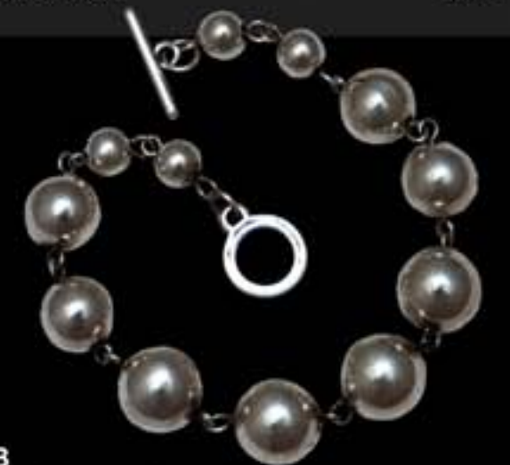
157B Silver Spheres Bracelet Pulsera de plata de las esferas 12 graduated size beads to grace your wrist. 7.5" with a toggle clasp.