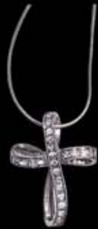
350N Ribbon Cross Neckalce Collar cruzado de la cinta Graceful inspiration glides on an adjustable 16 - 18" chain.