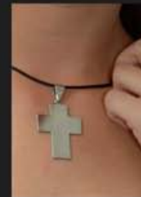
375N Milano Cross Necklace Collar cruzado de Milano A symbolic statement with fashionable style! Cross pendant is 2"H x 1.75"W on black leather.