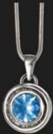
134N Blue Lagoon Necklace Collar azul de la laguna The perfect finishing touch to any outfit! Adjustable 16 - 18" chain