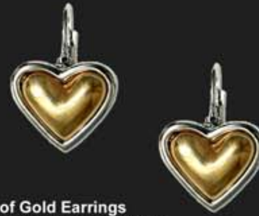
130E Heart of Gold Earrings Corazón de los pendientes del oro Gold hearts floating on hearts of silver make the perfect combination! Leverback silver wires. Hypo-allergenic