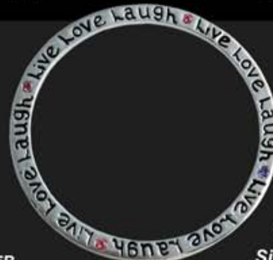
295B Live Love Laugh Bangle Bracelet Pulsera viva del brazalete de la risa del amor A daily reminder to have fun each day. Our flat bangle bracelet is inscribed on both sides with four inset stones. One size fits most.