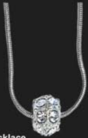
174N Crystal Ball Necklace Collar de la bola cristalina A dazzling sphere of crystals! 12 inset crystals. 16-18" adjustable chain.