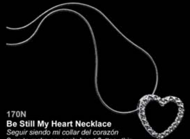
170N Be Still My Heart Necklace Seguir siendo mi collar del corazón Sure to make anyone's heart flutter - this charming heart floats on an adjustable 16 - 18" chain.