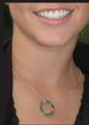
141N Circle of Joy Necklace Círculo del collar de la alegría Three joyful sentiments on each side - Love Hope Believe and Laugh Smile Dream. 16-18 adjustable chain