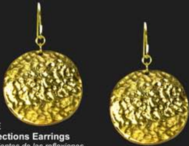
233E Reflections Earrings Pendientes de las reflexiones Hammered gold coins reflect golden rays in these stunning earrings. Coins are 1"D with French ear wires. Hypo-allergenic