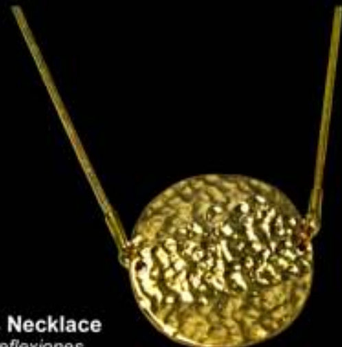
234N Reflections Necklace Collar de las reflexiones Golden rays radiate from this single hammered gold coin. Suspended from a solid gold chain. 18" L