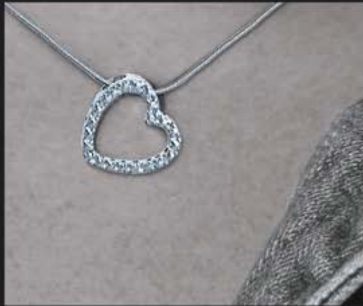
206N Love Charm Necklace Collar del encanto del amor LOVE spells love! A simple and charming tag charm for any occasion. 16 - 18" adjustable silver chain.