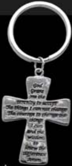
345M Serenity Key Chain Cadena dominante de la serenidad Carry a prayer! This cross keychain is inscribed with the meaningful Serenity Prayer. Cross is 2"H x 1.5"W.