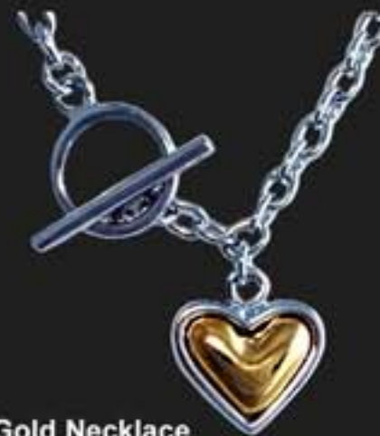
138N Heart of Gold Necklace Corazón del collar del oro The stylish front toggle makes for a classically elegant necklace. Gold and silver combine for that perfect look. 18"