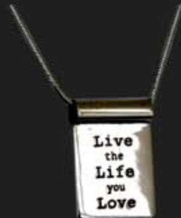
164N Love Your Life Necklace Amar tu collar de la vida Inspired elegance! Engraved with "Love the Life you Live" on one side and "Live the Life you Love" on the reverse. 16 - 18" adjustable.