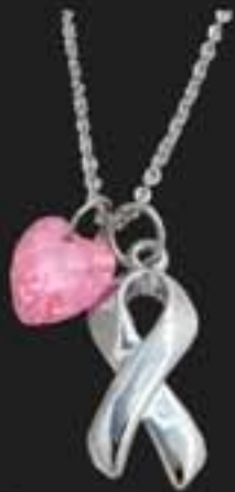
971N Pink Ribbon Charm Necklace Collar rosado del encanto de la cinta Offering hope for a cure! A silver ribbon charm and faceted pink crystal charm hang from a sparkling silver chain. 16 - 18" adjustable.