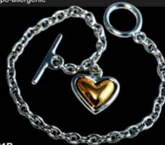
131B Heart of Gold Bracelet Corazón de la pulsera del oro A classic gold heart trimmed in silver, dangling from a chunky link chain. Toggle clasp. 7.5"