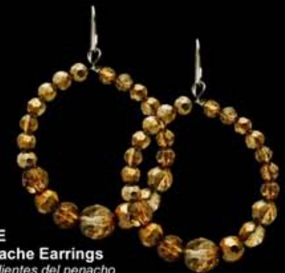
222E Panache Earrings Pendientes del penacho Stylish and trendy - these golden beaded hoop earrings are sure to dazzle. 1.25"D on French ear wires. Hypo-allergenic