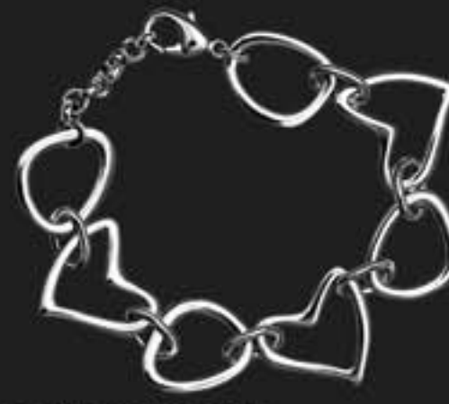
150B Hearts and Hugs Bracelet Corazones y pulsera de los abrazos Surround yourself with love! Lobster claw closure. 7.5" adjustable