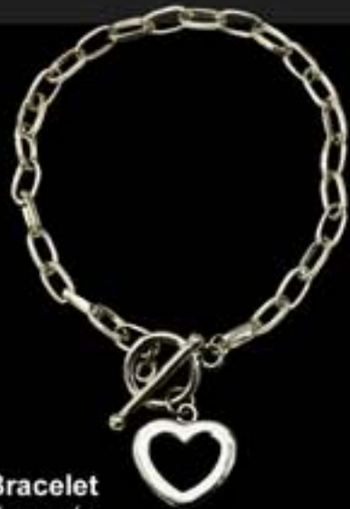
245B Open Heart Bracelet Pulsera pura del corazón Pure and simple! A classic flat link bracelet with a toggle clasp closure and open heart charm. 7.5"L