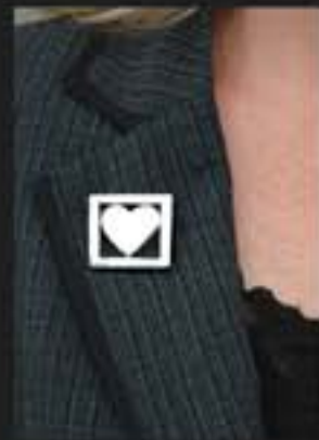
285M Love Letter Pin Pin de la letra de amor All wrapped up in love! This lapel pin is the perfect accessory any time of year. 1.25"W x 1"H with hinged bar pin.